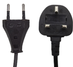
Country-specific plug adapter

i-tec USB 3.0 Charging HUB 16port with power adapter 90 W, 16x USB 3.0 charging port, ideal for laptop ultrabook tablet PC, Windows Mac Linux